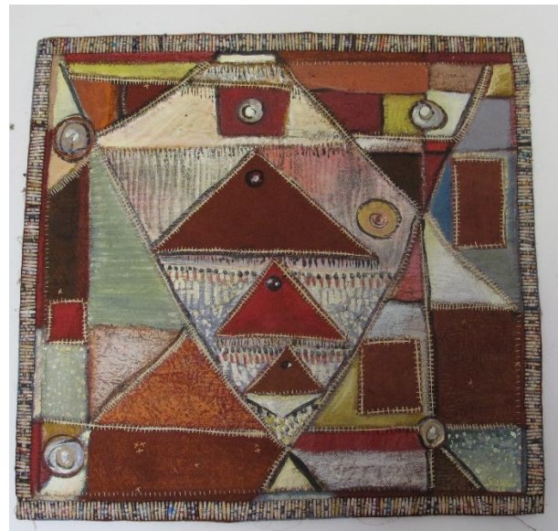
Figure 3 Lususu Easy Afric barkcloth products, African Craft Village, Kampala, June 2016 Figure 4 Mixed media artwork by Sanaa Gateja, June 2016