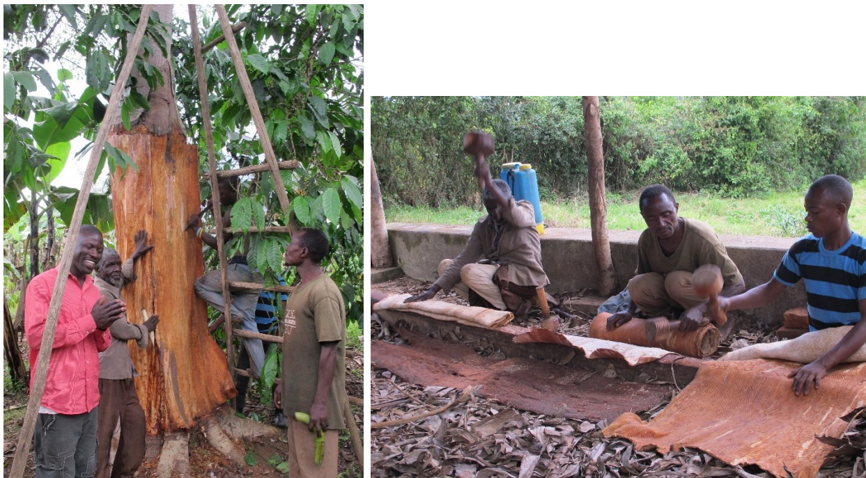
Figure 1 (left) Stripping the bark, Kibinge, May 2016 Figure 2 Beating the bark, Kibinge, May 2016

The cloth is produced by stripping lengths of bark from the mature mutuba tree, Ficus natalensis , which grow easily in this fertile central southern region of Uganda. After the removal of the bark the tree trunk is wrapped for protection, typically in banana leaves, which grew nearby, allowing another bark to grow, to be harvested again and again on an annual basis for up to 30 years. The stripped bark is cleaned of its outer layer, boiled or steamed, then beaten for several hours with a graduating series of heavy carved wooden hammers, causing the fibres to stretch up to five times in width and approximately one tenth in the length (Figures 1 and 2). The production of cloth from strips of bark is a skilled male occupation which was traditionally passed from generation to generation.